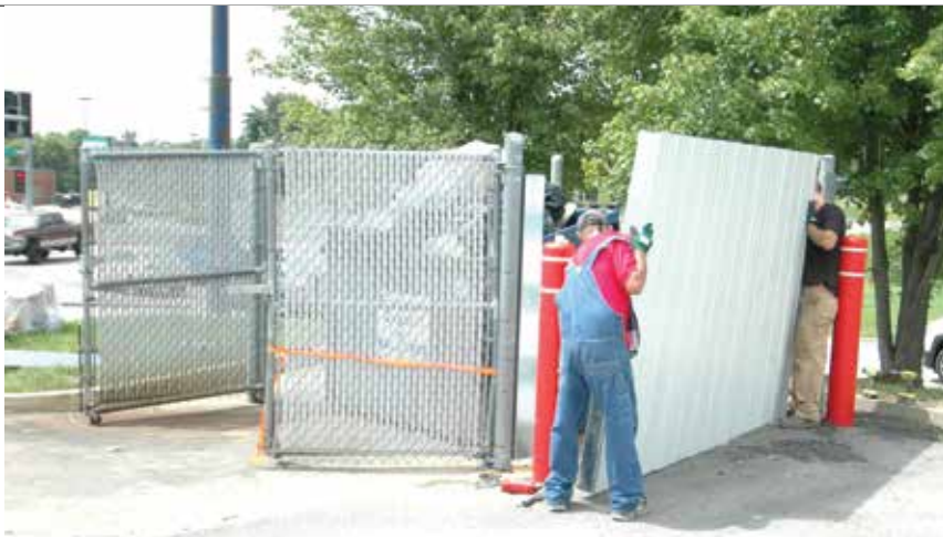
Taking down the chain-link fence enclosure (above) and putting up brick (below). First the fence is removed; then a frame is built and bracket installed on the four posts. Next comes a modular frame, followed by brick panels. The process takes less than a day.