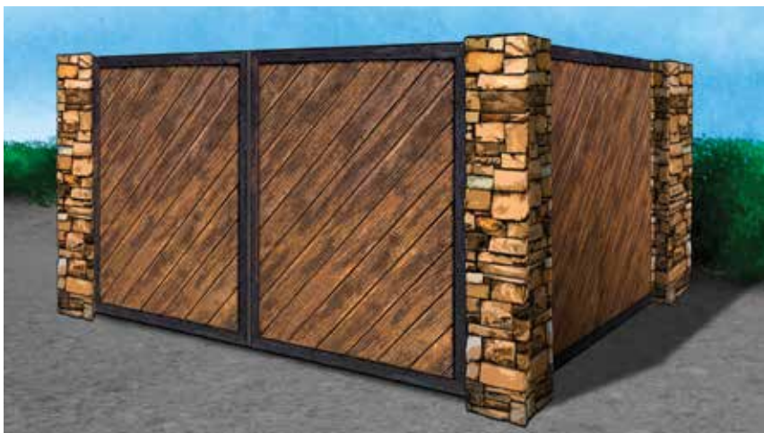
Renderings of modular enclosures, using brick and wood (top) and stone and wood (bottom).

closures. The system has very key innovations: