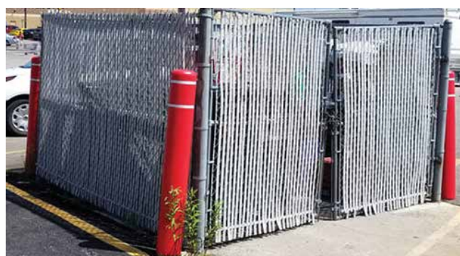
From eyesore to modular: Before (left) and after (right) a retail dumpster enclosure was renovated.

Why modular panel systems for dumpster enclosures are the new way to go.